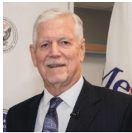
General Richard B. Myers Chairman of the Board of Trustees, Medisend College Four-Star General, USAF, Retired 15 th Chairman of the Joint Chiefs of Staff

The mission of this institution is to provide high-quality, intensive education and training that prepares graduates for professional careers as biomedical technicians. Our graduates obtain sought-after jobs at top industry pay after receiving the quality education provided by Medisend College. The accelerated programs we offer are a perfect fit for transitioning service members and veterans, as well as civilians. We want all our students to build financial security. I believe our job is not done until each student gets the opportunity for a career.